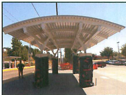
Shelter Installation In Progress