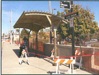
Shelter Installation in Progress