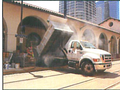
Base for Paver Installation