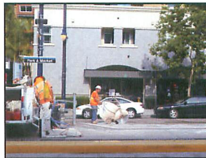
West Platform Demolition in Progress