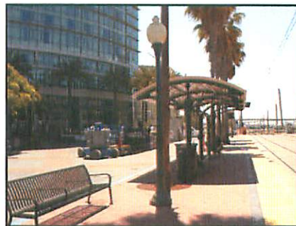
North Platform Shelter and Furniture Installed - Opened for Boarding