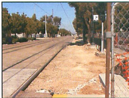
South Platform Under Construction