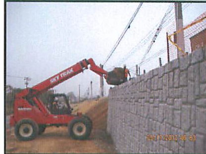
Finalizing Retaining Wall for Signal Cabinets