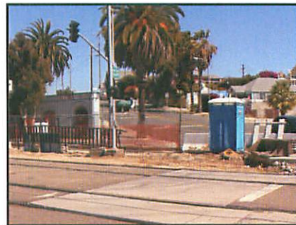
South Platform Demolition Complete