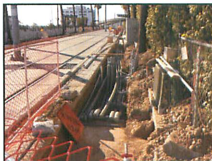
Conduit Installation – Both Platforms