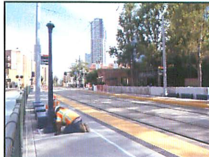
Station Closed for Construction