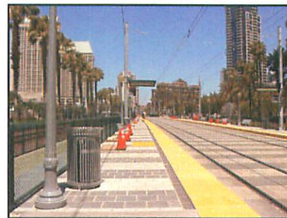
Platform Paving Completed - Opened for Boarding