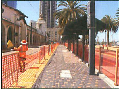
Installation of Brick Pavers