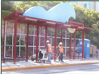
Station Demolition in Progress