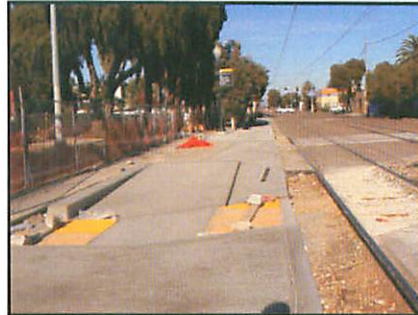
North Platform Under Construction