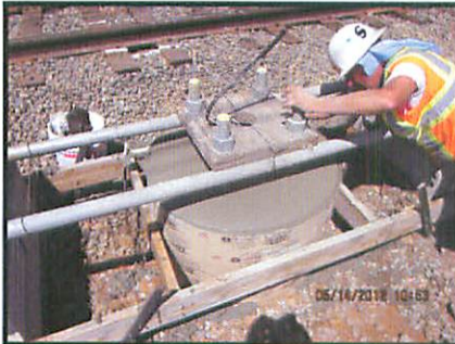
Installation of Signal Pedestal