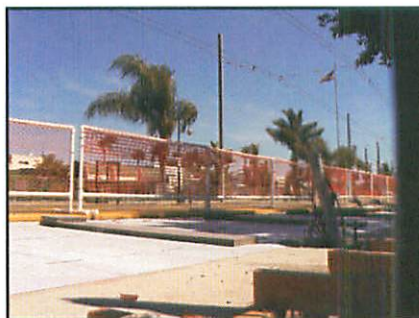
West Platform Improvements in Progress