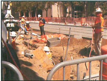
South Platform Conduit Installation