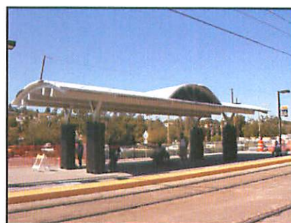
Shelter Construction in Progress - Platforms - Open for Boarding