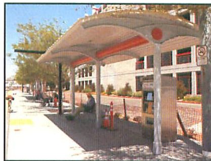
Station Shelters and Furniture Installed