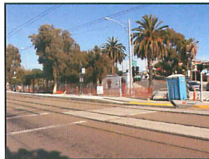
South Platform Demolition Complete