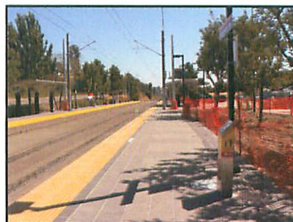
Platforms Open for Boarding