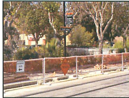
North Platform Improvements in Progress