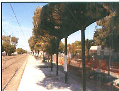
South Platform Under Construction