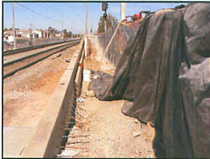
Retaining Wall on Imperial Avenue in Progress