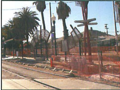
North Platform Under Construction