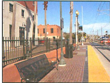
Station Shelters and Furniture Installed