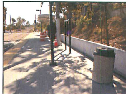
Shelter Construction in Progress - Platforms - Open for Boarding