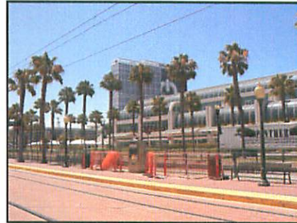
South Platform Opened for Boarding