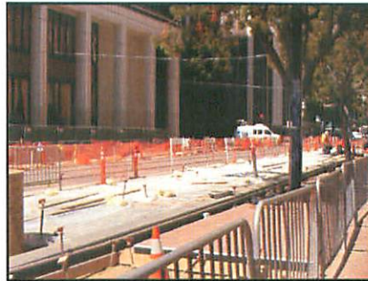
North Platform Being Installed