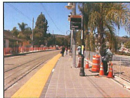
East Platform Open for Boarding