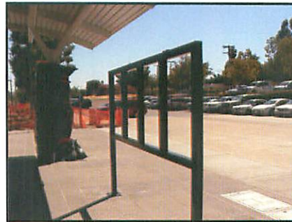
Station Furniture Installation