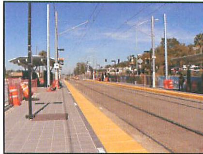
North Platform Pavers