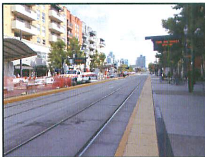
East Platform Boarding