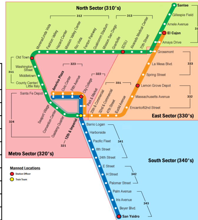
MTS Sector/Beat Map